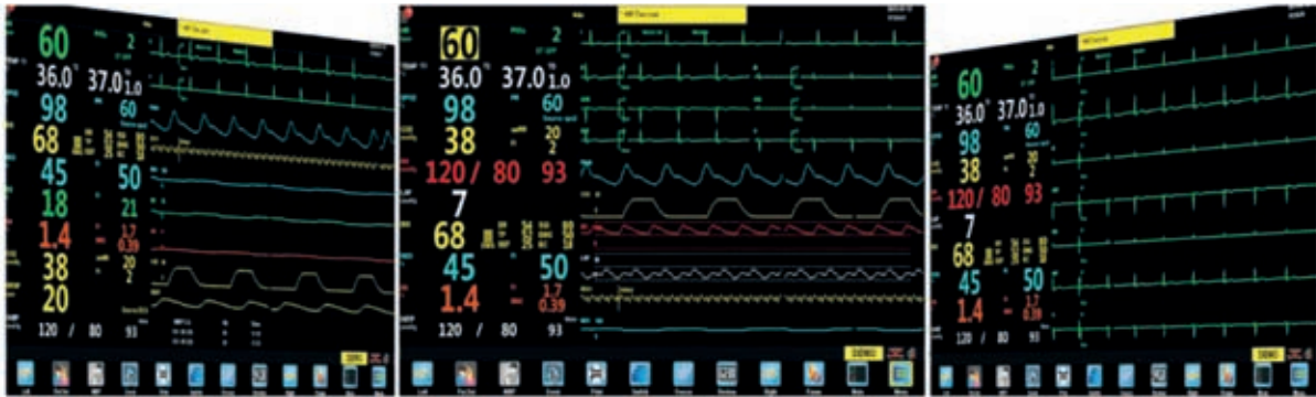
Vivid visualized icons ... Engineered for the most impressive operation

SEV:0-10%: \pm (0.15%+5% of the reading) DES:0-22%: \pm (0.15%+5% of the reading) Agent identification time: <20s(typical <10s) AWRR range: 0-150 bpm AWRR accuracy: \pm 1 bpm Apnea time: 20~60s